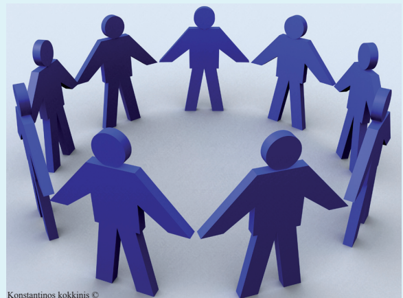
Konstantinos kokkinis ©

THE NEWS CENTER of Forensics.ca is a Global News Syndicate, generated by media organizations and consumers around the world to provide fast and accurate news information. In 2005, Forensics.ca filed over 10,000 news items relating to the field of forensic science; including more than 2000 “latest news” alerts and 500 video news stories from more than 50 countries around the world.